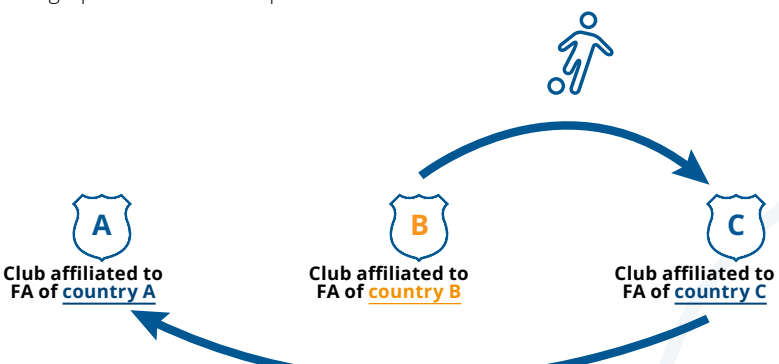
Club A is entitled to receive TC from club C.

compensation between clubs affiliated to the same member association, provided that the transfer which triggered the training compensation involved two clubs affiliated to different member associations. The rationale here is the same as that described above in relation to the solidarity mechanism. The below graphic describes this process: